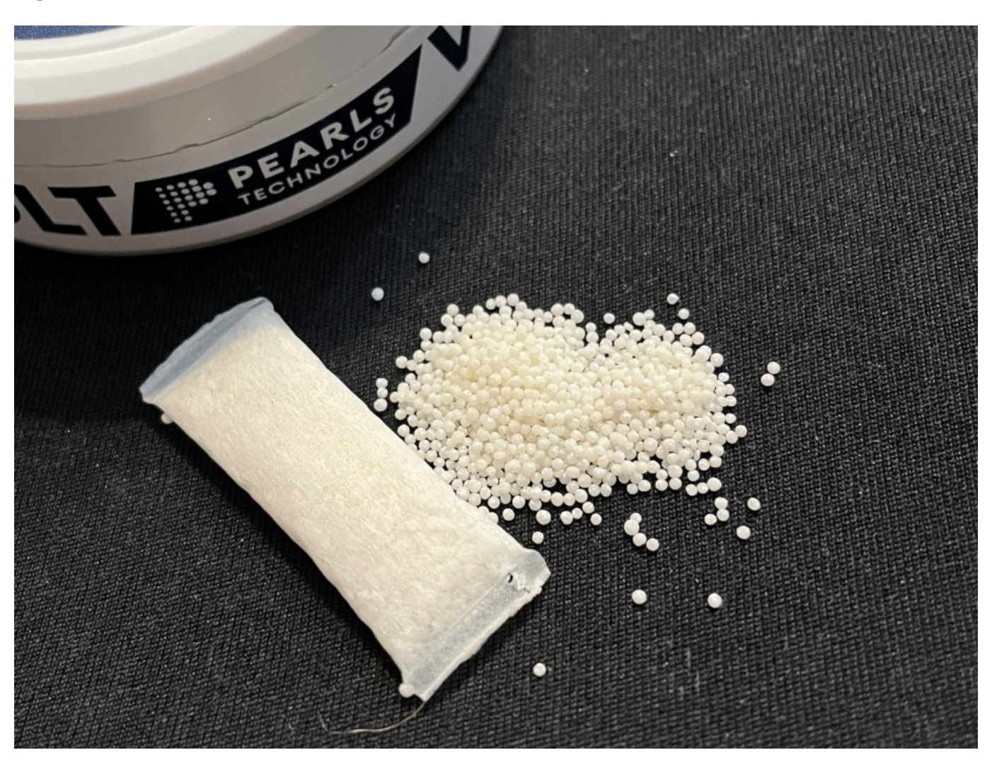
Figure 2: Tobacco-free nicotine pouches

Since about 2009, novel tobacco-free oral products have emerged including nicotine pouches (Figure 2) and dissolvable 'pearls', available in many different flavours and nicotine strengths. These products contain nicotine -- either synthetic or extracted from tobacco -- but not tobacco. Experience from the USA and <u>Australia</u>, where they have been recently introduced, suggests oral nicotine products are often marketed to appeal to young people.<sup>7</sup> Examples of product presentation are shown in Figure 3.