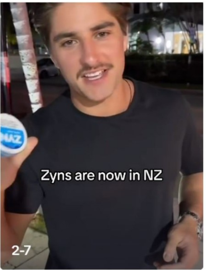
Order now stocks wont last sale on #nz #carcommunity...